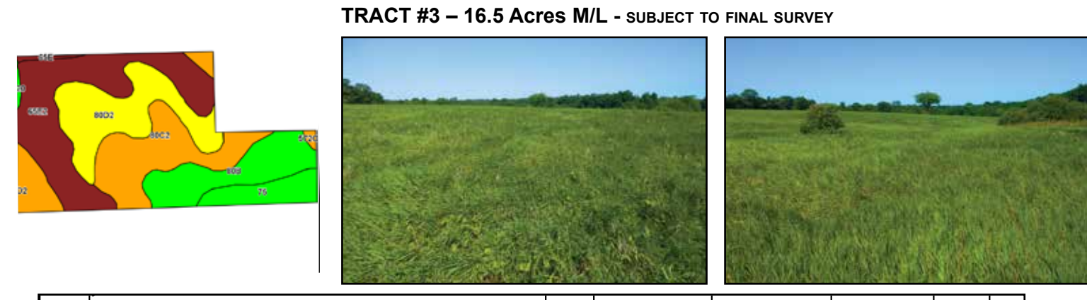
TRACT #3 - 16.5 Acres M/L - SUBJECT TO FINAL SURVEY