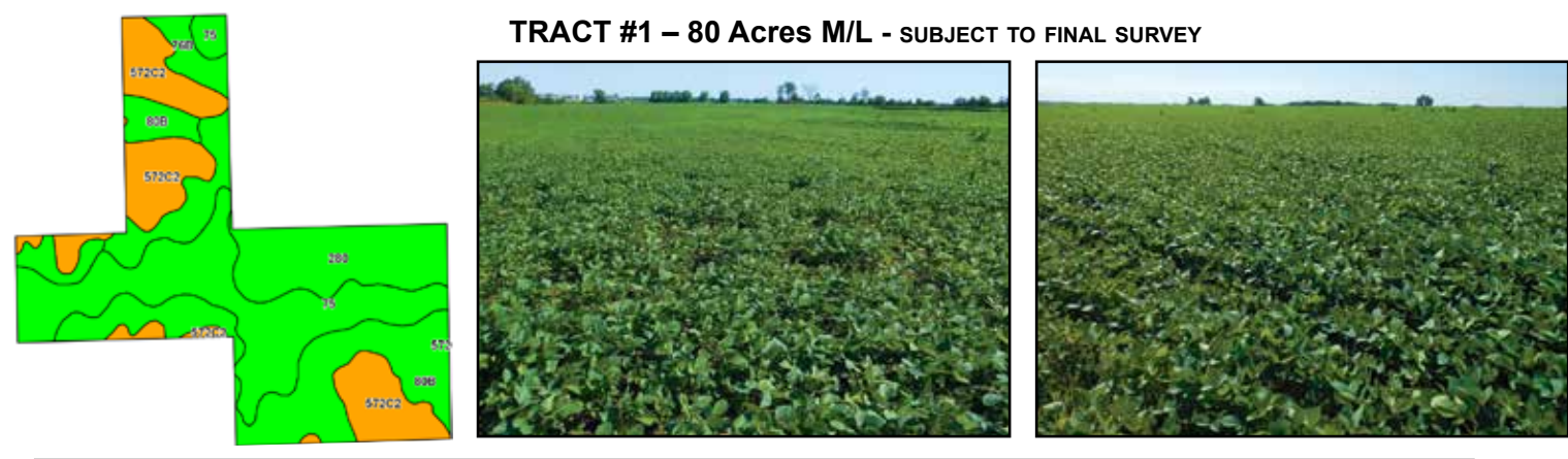
TRACT #1 - 80 Acres M/L - SUBJECT TO FINAL SURVEY

Auction to be held at the Youth Learning Center at the Louisa County Fairgrounds, Columbus Junction, IA