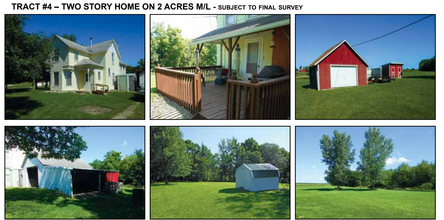
TRACT #4 - TWO STORY HOME ON 2 ACRES M/L - SUBJECT TO FINAL SURVEY

VIEW STEFFESGROUP.COM FOR COMPLETE DETAILS